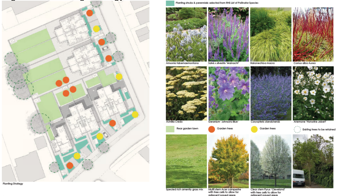
Figure 6 – Planting Strategy