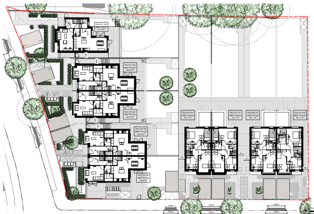
Figure 2 – Proposed Site Layout