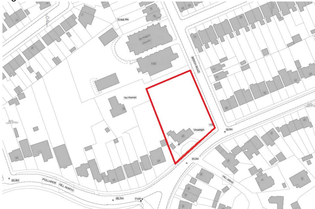
Figure 1 - Site Location